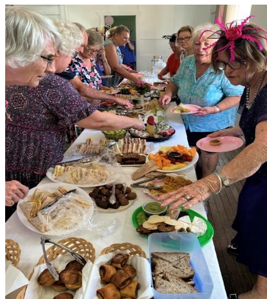
Guests enjoying their “Banquet”

ALWS tells us: in the light of a world facing many challenges – war in Ukraine, earthquakes in Turkey & Syria, famine in Somalia; how does a small community like ours in Australia, facing its own challenges, bring love to life? It has been one year since Russia began its illegal invasion of Ukraine and 40,000 people including over 400 children have been killed; more than 46,000 people died in the earthquakes and in Somalia, millions are facing famine. It was noted that Somalia donations attract an 18-1 matching grant. Hence a proposal was carried that our Zone project for this year and our offering from today which amounted to $603 be split into three equal parts to be directed to victims of the war, earthquakes and famine through ALWS.