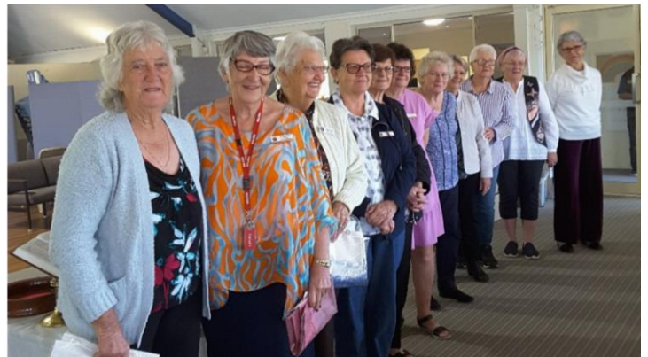
The L egendary W elcoming Q uirky WMZ host ladies

On several occasions throughout the weekend, we were 'confined' to our animal cages! Each individual 'caged animal' produced a face mask from supplied 'junk' items to depict themselves. And then come up with a slogan to sell themselves! We had cages of llamas, elephants, meerkats, monkeys, koalas, pandas, giraffes, wombats, lorikeets and cassowaries – all manner of paws, claws, feathers and fur! We were back 'in our cages' for Bible Study