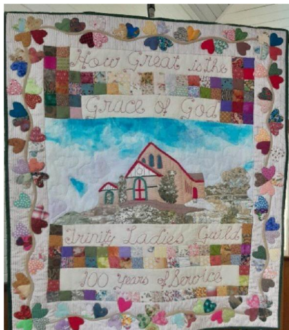
"How Great is the Grace of God" banner featuring 100 hearts to depict 100 years of service of the Boonah Women's Guild

By 1989 the attendance of Guild meetings was down to the mid-twenties. The Church had become the Trinity Lutheran Congregation around the mid 1990's, so Trinity Lutheran Women's Guild, Boonah, became our new name. By 1995 our membership surged to 50 again, with attendance at meetings approximately twenty. It was reported at our 90 th Anniversary that the average attendance was 11 with a membership of 23.