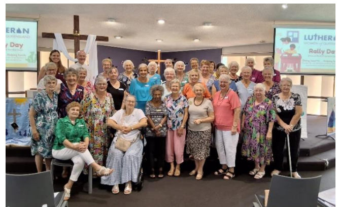
Members of BN & SC ZONE